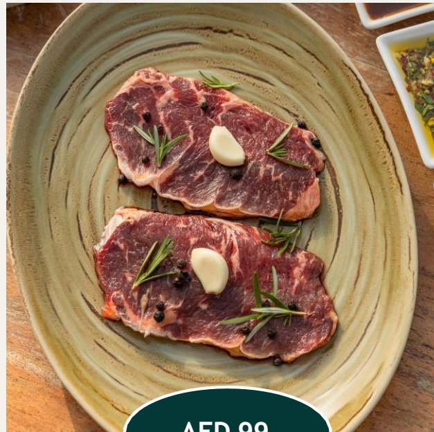
Striploin 300 grams