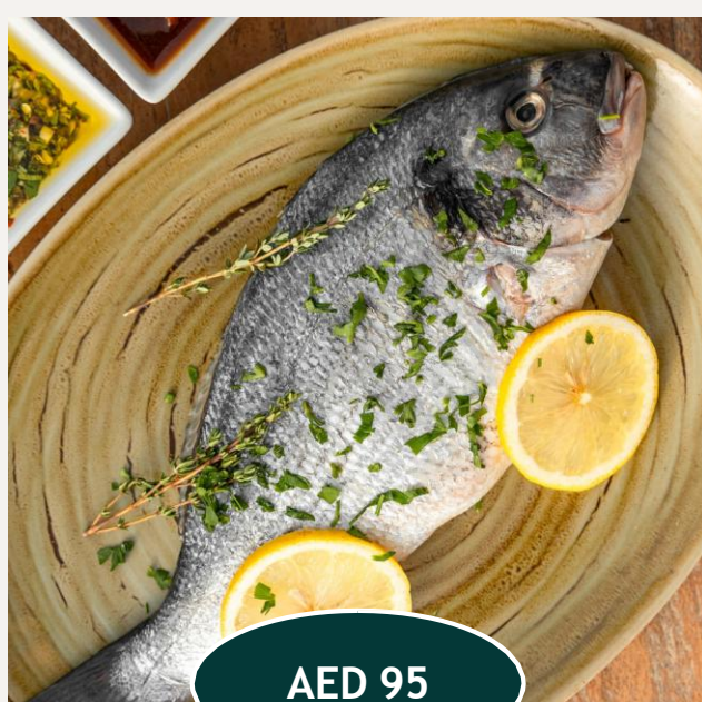
Seabream 300 grams