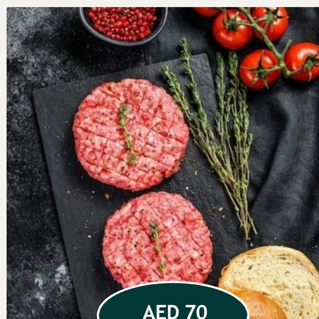
Burgers 300 grams