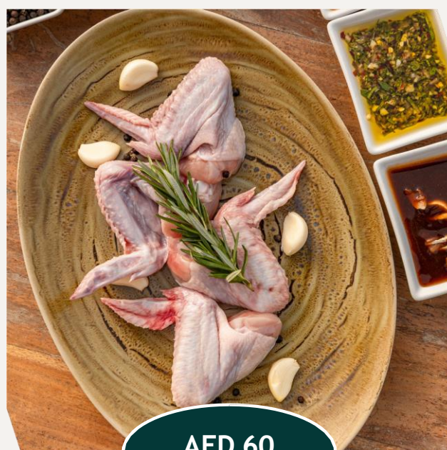
Wing Drumettes 500 grams