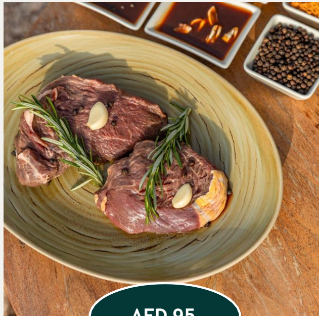
Lamb Steak 300 grams

Preparation Time: Approximately 2 hours. Each order includes your choice of 1 signature sauce and 2 sides of your choice.