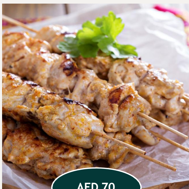
Shish Tawook 300 grams