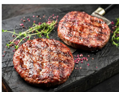
Beef Patty 500gm AED 120