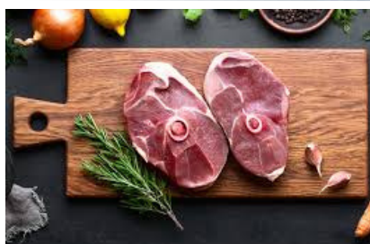
Lamb Steak 500gm AED 165