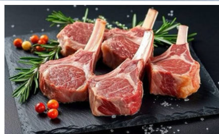
Lamb Chops 300gm AED 175