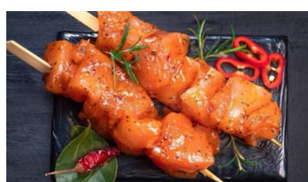
Shish Tawook 400gm AED 95