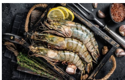
Tiger Prawns 500gm AED 150