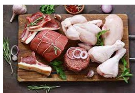
Mix Platter Meat : Rib Eye Steak, Lamb Chop, Shish Tawook, 2 Sides, 2 Sauces AED 350

Mix Platter Seafood : Tiger Prawns , Half Mussels, Squid Rings , Sea Bream , 2 Sides, 2 Sauces AED 250