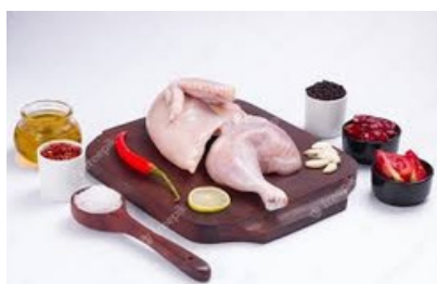
Half Chicken 400gms AED 80