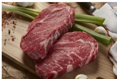
Rib Eye Steak 300gm AED 189